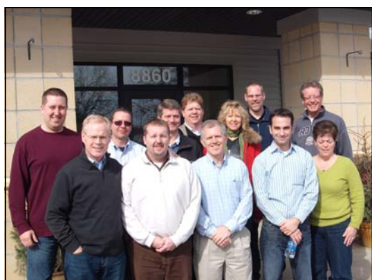
The Crown College President’s Council made use of the District Office conference room for their day-long meeting on March 17.

of Crown College stood in recognition of God’s amazing work in the life of a radical Muslim who “left his father’s house!”